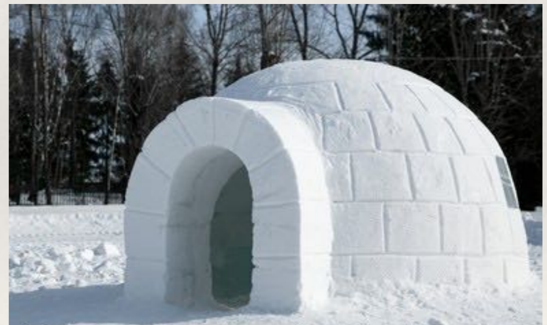
Functionally Suitable Matter