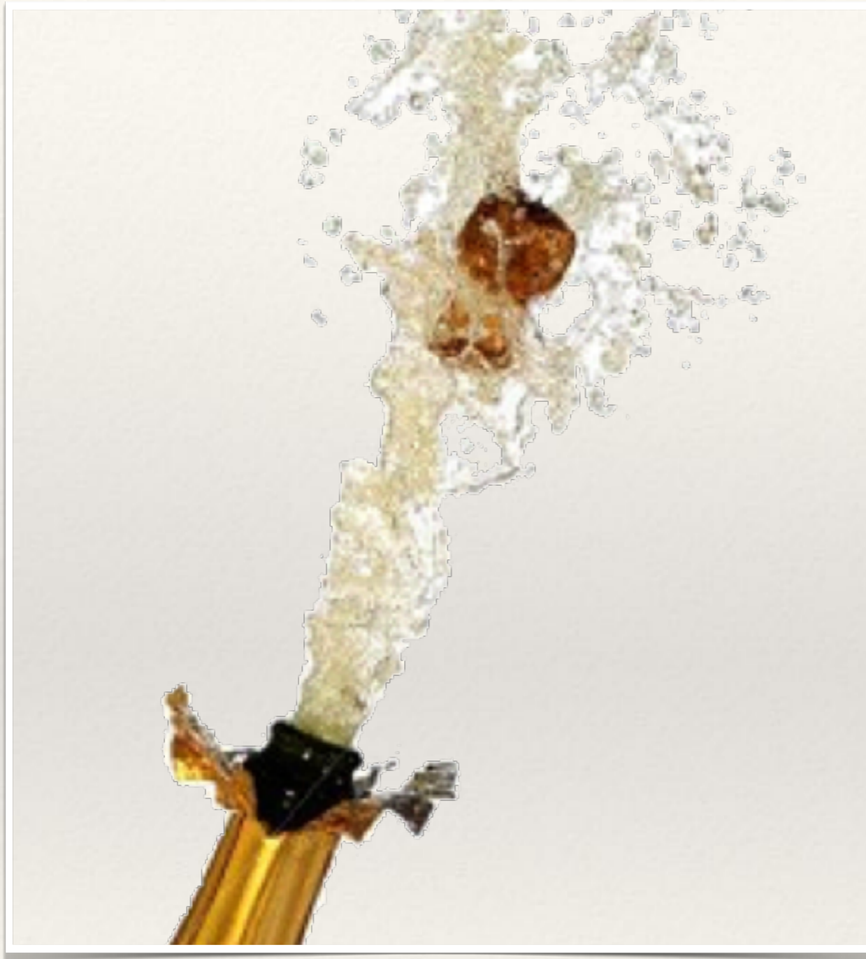
Not Functionally Suitable Matter